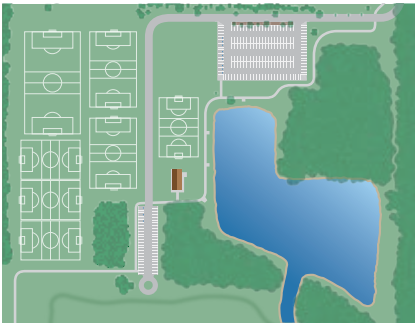
Walker Road Park