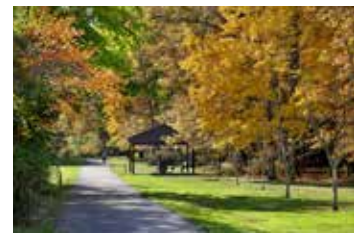
Russ Lynch Centennial Park

City of Avon Lake Department of Parks & Recreation AvonLakeRec.com 440-930-4130