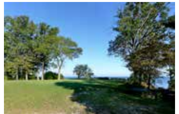
West Shore Park