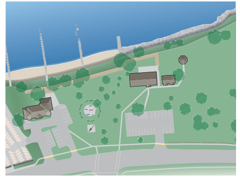
Veterans' Memorial Park