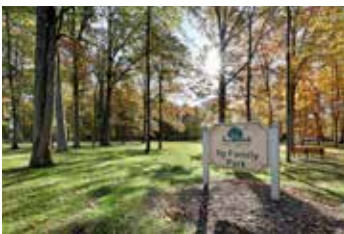
Ilg Family Park