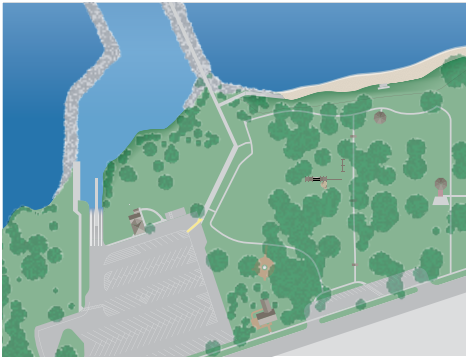
Miller Road Park & Boat Launch